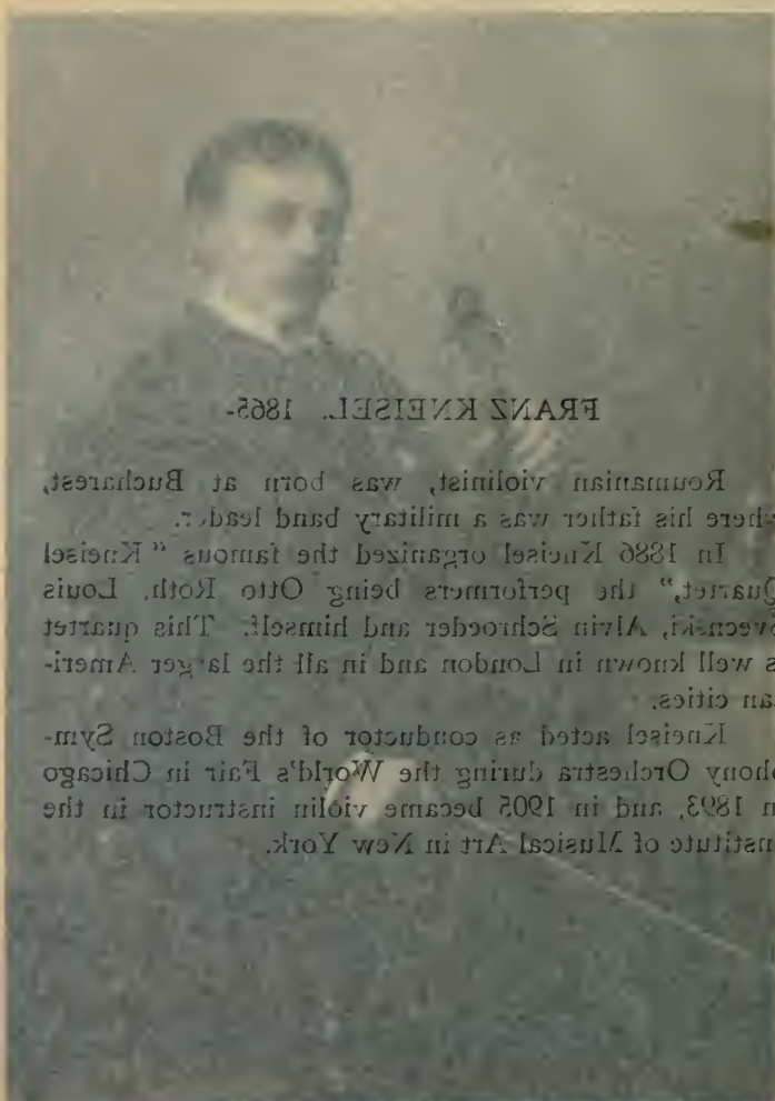
FRANZ KNEISEL. 1865-

Rommanian violinist, was born at Bucharest, where his father was a military band leader.