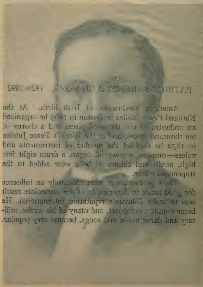
PATRICK SARSFIELD GILMORE. 1829-1892

American bandmaster of Irish birth. At the National Peace Jubilee in Boston in 1879 he organized an orchestra of one thousand pieces and a chorus of ten thousand voices, and at the World's Peace Jubilee in 1872 he doubled the number of instruments and voices—cannot a powerful organ, a drum eight feet high, and chimps of bells were added to the stupendous whole.